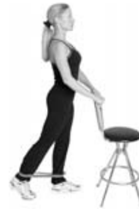
Hip Extension - Finish