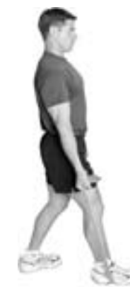
Arm Curl - Start

Tips: Keep ankle locked and in neutral position. Make sure to keep knees parallel throughout entire range of motion.