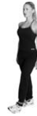
Hip Flexion - Start

Tie and knot Fitness Band to form a loop. Place Fitness Band just above ankles. From a standing position push leg backward and contract gluteal. Hold on to a stable object if desired. Tip: Maintain upright posture and do not attempt to increase range of motion by leaning forward or arching back.