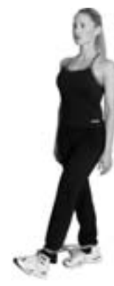
Hip Flexion - Finish