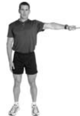
Single Arm Pec Fly - Start

From a seated position on floor, with knees slightly bent, center Fitness Band under buttocks and hold or wrap ends around hands. Starting at ear level with palms facing forward or slightly inward, push upward and straighten arms to finish with hands directly above shoulders.