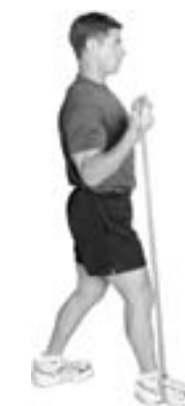
Arm Curl - Finish