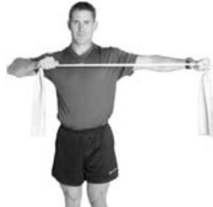
Tricep Extension - Finish