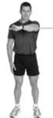
Single Arm Pec Fly - Finish