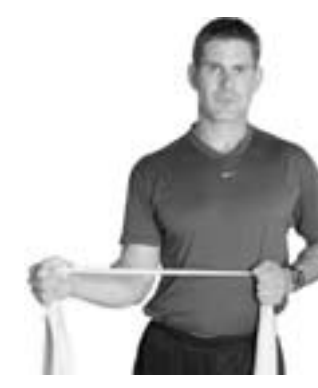
External Rotation - Finish