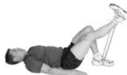
Knee Extension - Finish