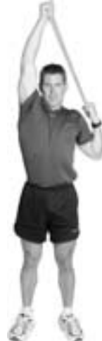
Single Arm Pulldown - Finish