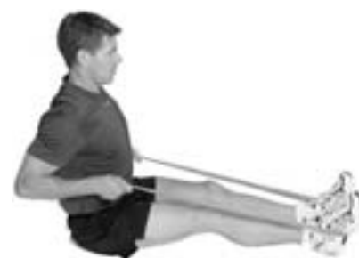
Seated Row - Finish