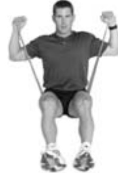
Seated Overhead Press - Start

Tie and knot Fitness Band to form a loop. Hold ends of Fitness Band and raise arms overhead with palms facing. Pull down with one arm driving elbow toward side of body.