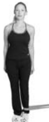
Adduction - Finish