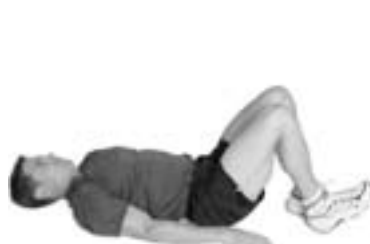
Knee Extension - Start

From a standing position, hold Fitness Band in front of chest. Bend elbows and pull back in line with shoulders and have palms facing or toward floor. Keeping one arm stationary, extend other elbow outward until arm is straight. Can be performed unilaterally or alternating. Tips: Keep shoulders stationary, elbows in line with shoulders, and move only from elbows throughout movement. Variation: Press Down. From a standing position, anchor/center Fitness Band above head height. Grasp ends of strip and begin slightly above elbows. With palms facing, straighten arms keeping elbows under shoulders and against sides.