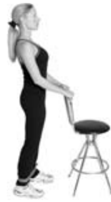
Hip Extension - Start

Tie and knot Fitness Band to form a loop. From a standing position, place Fitness Band slightly above ankles and push leg outward. Hold on to a stable object if desired. Tips: Do not attempt to gain range of motion by leaning or bending torso. Lead with heel and keep toe pointed forward to prevent leg from externally rotating. To lessen forces on the knee, place Fitness Band closer to knees. Variation: Side-Lying. Place Band slightly above ankles, or toward knees, and lift top leg.