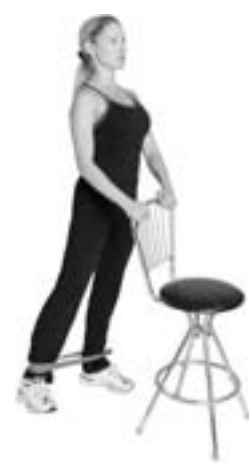
Hip Abduction - Finish