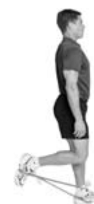
Standing Leg Curl - Finish