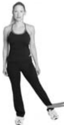
Adduction - Start

Tie Fitness Band to a stable and unmovable anchor or use another person. Stand parallel to anchor with arm out to side at shoulder height and elbow slightly bent. Keeping elbow bent, lead with thumb and pull toward midline of torso, in front of chest.