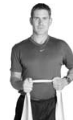
External Rotation - Start

Tips: Keep elbows back and underneath shoulders to keep emphasis on biceps and not front shoulders. Variation: Perform from a lunged position with Fitness Band under front foot. Keep head and chest up. Change grip to palms facing inward, (neutral or hammer grip), to emphasize the brachioradialis and brachialis (muscles across the elbow and underneath the biceps).