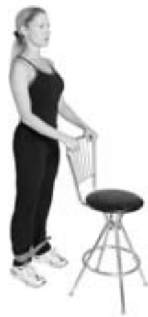
Hip Abduction - Start