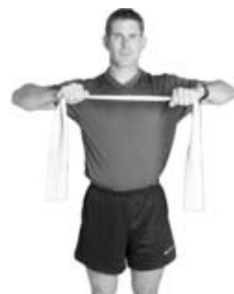
Tricep Extension - Start

From a seated position, with knees slightly bent and feet together, center Fitness Band behind arches of feet. Hold ends with palms facing inward and pull backward by drawing the elbows along side the torso. Tips: Keep chest up, with shoulders back and down throughout the exercise. Variation: Change grip to palms down with elbows away from torso to emphasize more upper back and rear shoulder.