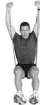
Seated Overhead Press - Finish