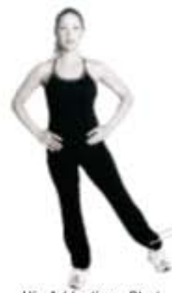
Hip Adduction - Start

In a side-lying position, place Fit Ring slightly above ankles and lift top leg upward. Tips: Do not attempt to gain range of motion by rolling or moving torso. Lead with heel and keep toe pointed forward to prevent leg from externally rotating. To lessen forces on the knee, place Fit Ring closer to knees. Variation: Standing. Place Fit Ring slightly above ankles and place hands on hips or hold on to a stable object. Starting with leg abducted, pull inward and bring legs together.