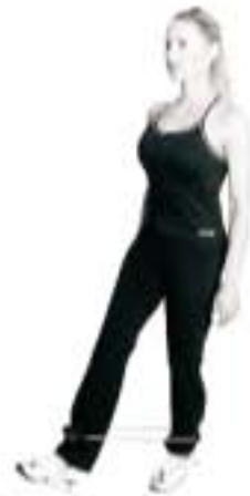
Hip Flexion - Finish