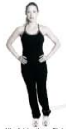
Hip Adduction - Finish