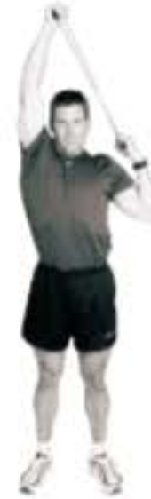
Single Arm Pulldown - Finish