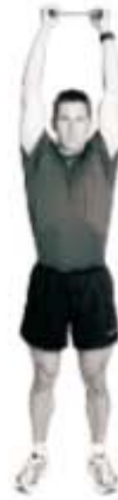
Single Arm Pulldown - Start

Place Fit Ring just above ankles and from a standing position rest hands on hips or hold a stable object. Push leg forward while maintaining upright posture. Tip: Maintain upright posture and do not attempt to increase range of motion by leaning forward or arching back.