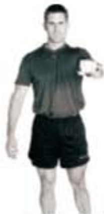
Single Arm Pec Fly - Finish