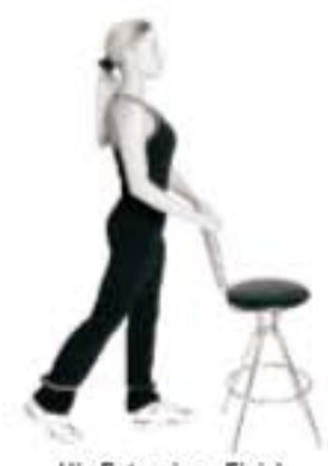
Hip Extension - Finish