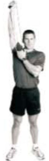
Single Arm Overhead - Finish