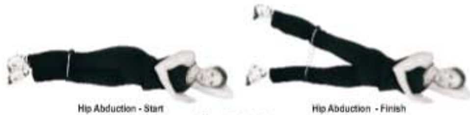
Hip Abduction - Start