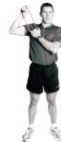
Single Arm Overhead Press - Start

Grasp handles and raise hands overhead with palms facing. Pull one handle down, driving elbow toward side of body.