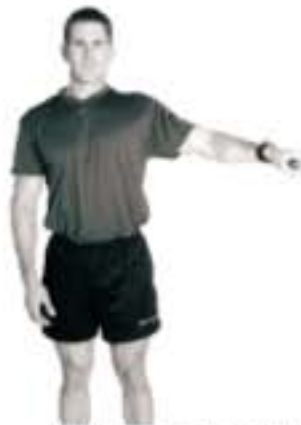
Single Arm Pec Fly - Start

Place one handle across body and anchor fist between chest and shoulder. Grasp other handle and bring to ear level. Press overhead and straighten arm.