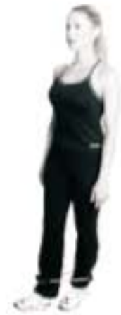
Hip Flexion - Start

Place Fit Ring just above ankles and from a standing position rest hands on hips or hold a stable object. Push leg backward and contract gluteal. Tip: Maintain upright posture and do not attempt to increase range of motion by leaning forward or arching back.