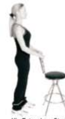
Hip Extension - Start

Anchor Fit Ring about ankle height and place outside foot inside. Stand at distance so there is tension when leg is lifted out to side, (abducted), toward anchor. Place hands on hips or hold on to a stable object. Starting with leg abducted, pull inward and bring legs together.